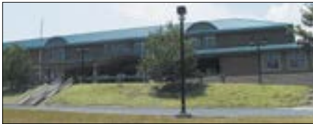
Mountain View Elementary