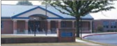
E.H. Phillips Elementary