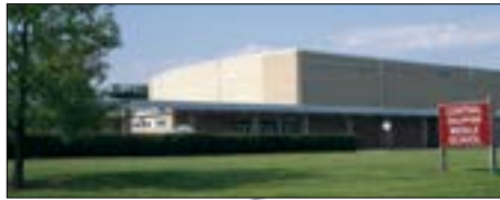
Central Dauphin Middle