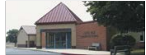
South Side Elementary