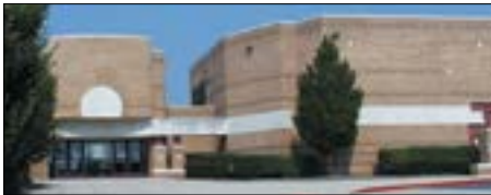
Middle Paxton Elementary