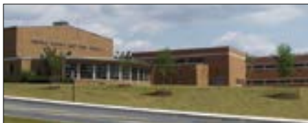
Central Dauphin East High