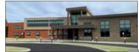
West Hanover Elementary