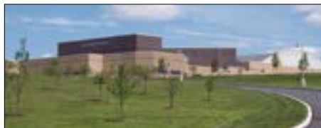
Central Dauphin High