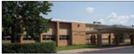
Central Dauphin East Middle