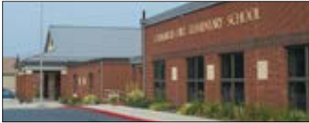
Chambers Hill Elementary