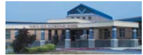
North Side Elementary